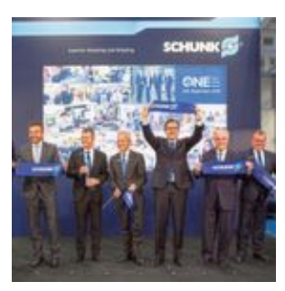
Schunk is investing 85 million euros in its production sites