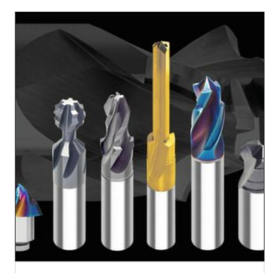
To create ideal conditions for ultra, high-quality tools, Inovatools uses premium carbide.

Inovatools manufactures special tools for complex tasks in the µm range, inclusive of coating and offers their shipment within a week.