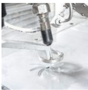
Water jet cutting -Function, methods and application examples